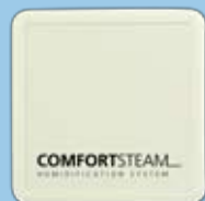
Electronic Humidistat With Outdoor Sensor