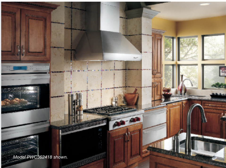
Model PWC362418 shown.

With standard features like heat sentry and dual setting halogen lighting, Wolf pro wall chimney hoods provide the ultimate in ventilation. Pro wall chimney hoods are available in four widths. The pro wall chimney hood installed with an optional 6", 12", 18" or 24" stainless steel duct cover completes the chimney design.