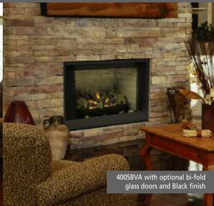
400SBVA with optional bi-fold glass doors and Black finish