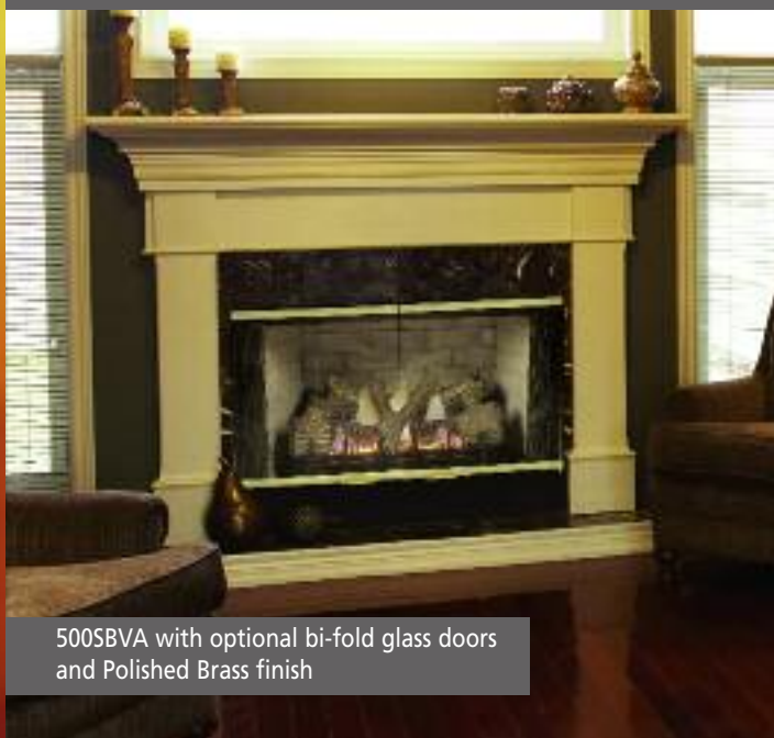
500SBVA with optional bi-fold glass doors and Polished Brass finish

Give people a place to gather – make fire the focal point of your room again with our B vent fireplace systems from Majestic.