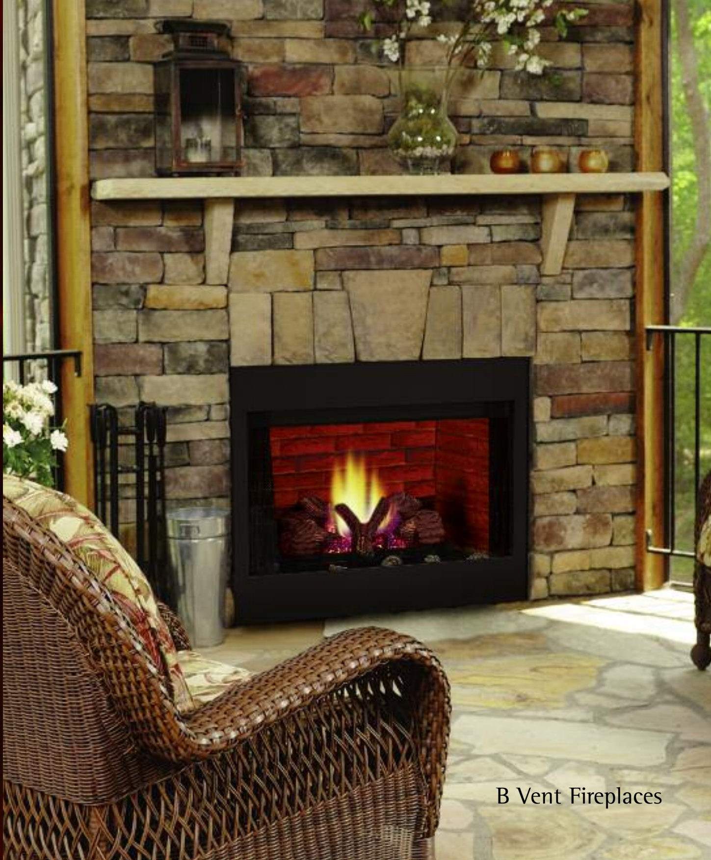
B Vent Fireplaces