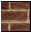
Tavern Brown firebrick