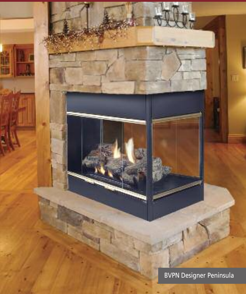
BVPN Designer Peninsula