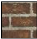
Cottage Red firebrick

Thermostat ON/OFF remote control with 3-step flame height adjustment and 3-speed blower control with receiver