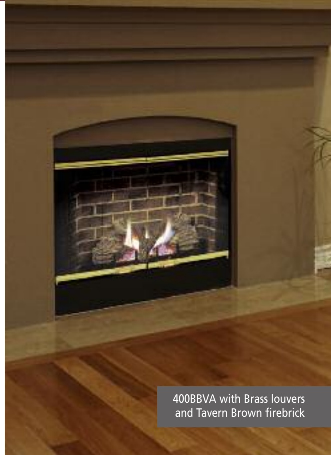
400BBVA with Brass louvers and Tavern Brown firebrick

With 36 and 42 inch sizes, the SBV Series of B vent fireplace systems from Majestic also offer an expansive view. Both sizes come with standard refractory brick and a Black firescreen. With an impressive BTU range from 29,000 to 31,000, the SBV Series are ideal choices for hard to heat rooms.