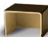
Metal insulated remote receiver cover