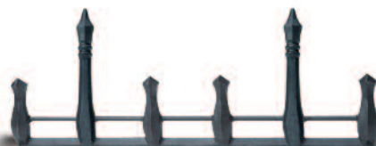
Decorative grate + Andirons

See our Ambient Technologies® catalog for a complete line of remotes.