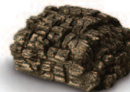
Ember remote receiver cover