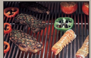
Infrared Plus...Stainless Steel Traditional Burners