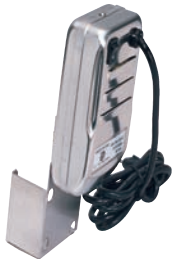
PFR80-97 (Motor Bracket Included)