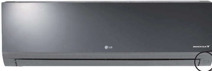
Location of light-emitting diode (LED) displays