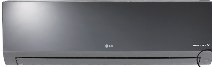
Location of light-emitting diode (LED) displays