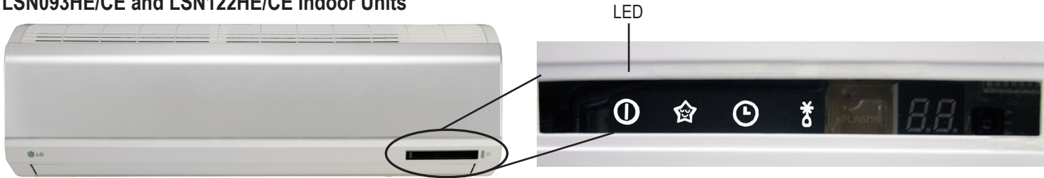
Location of light-emitting diode (LED) display