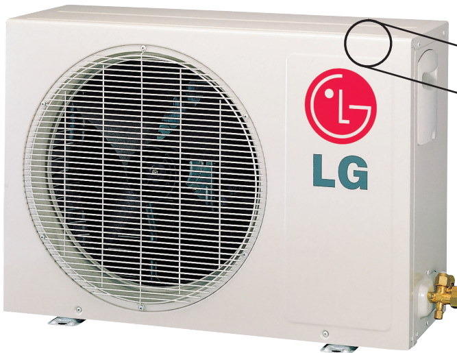
Location of PCB LED: To access, remove outdoor unit cover, and then remove lid to PCB box.